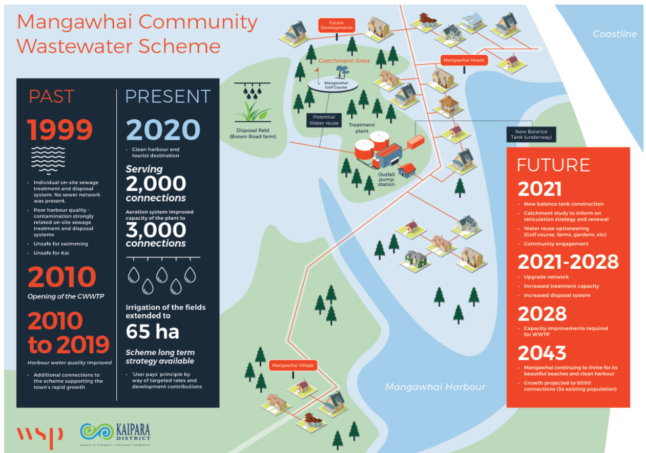
Figure 2 - Poster presentation (also on KDC website)

The scheme will require phased upgrades of wastewater network pump stations, mains and gravity sewers as new properties are developed and infill housing occurs. This will influence